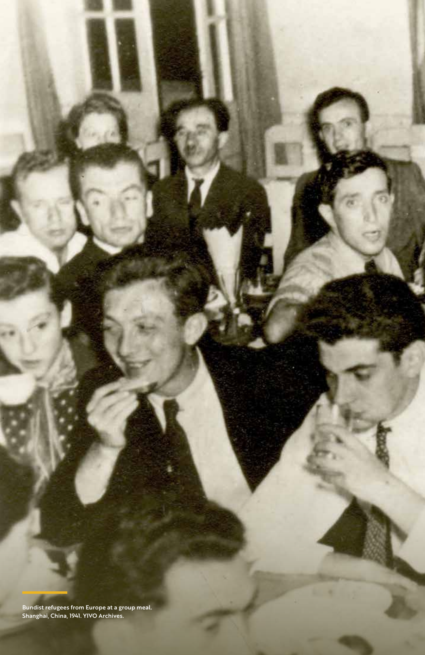
Bundist refugees from Europe at a group meal. Shanghai, China, 1941.